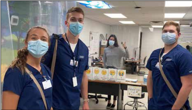
Carroll University Associate Degree in Nursing students gather for class at the United Community Center.

The UCC School-Based Health Center also serves as a clinical placement site for nursing students, where they can learn about a school-based RN role and skills needed in a school setting. The UCC also is home to Carroll's new Associate Degree in Nursing (ADN) program, which helps underrepresented students become an RN in less than two years.