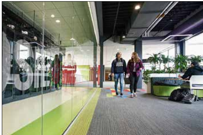
MSOE's supercomputer, "Rosie," pictured at left behind glass, is available for undergraduate use as they work to solve real-world problems.

in demand for their skills in artificial intelligence (AI), cybersecurity, machine learning, and next generation technologies. Armed with experience using Rosie (MSOE's supercomputer) to solve-real world problems for MSOE's industry partners and guidance from MSOE's expert faculty, they truly were prepared to hit the ground running.