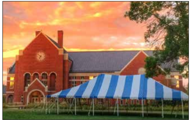
Many of the activities for Northland's Fall Festival will take place in the tent on the Campus Mall outside the Ponzio Campus Center.