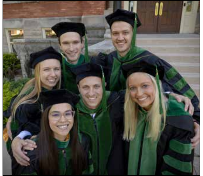
The 2022 Commencement Ceremony of the Medical College of Wisconsin Green Bay's fifth class included its 100th graduating physician.