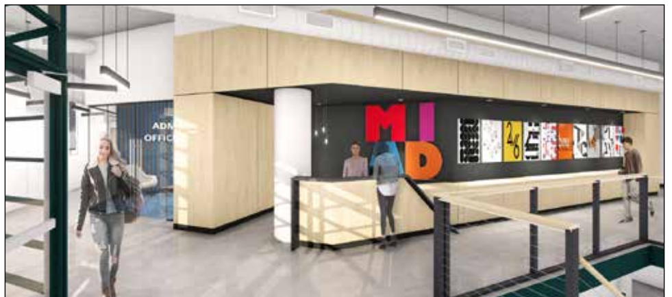
Pictured above is an artist's rendering of Milwaukee Institute of Art & Design's Community Hub main entrance lobby, which will include the admissions office and reception area.

the facility. The new entrance will provide visitors with an immediate sense of MIAD's mission through a suite of technology displaying student work, facilities, resources, and campus messaging. MIAD hired RINKA to design the new space, with Greenfire Management Services performing the construction