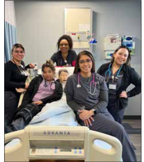
Herzing University proudly offers high-quality skills training and flexible career paths for nursing and healthcare students of all backgrounds.

As Herzing continues to provide exceptional education and support, the designation of a Hispanic-Serving