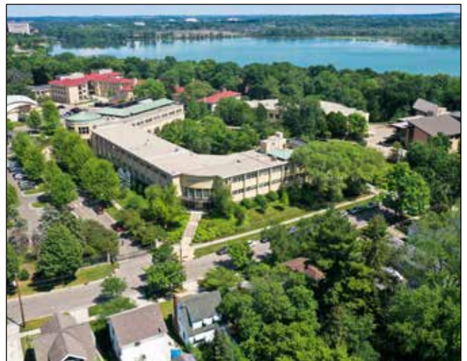
Aerial view of the Edgewood College campus.

online Master of Arts and online Master of Science degree programs were among the first to be introduced through this new partnership and delivery initiative. A brand-new online Doctorate in Business Administration (DBA) degree is next in the queue to be available for students worldwide.