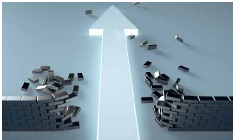
WAICU and WTCS have partnered together to remove barriers and to provide a guided transition to a higher education experience.

Sadly, among all foster youth, only 3 to 4 percent obtain a four-year college degree. To support the dreams and aspirations of these students, WAICU and WTCS have partnered together to remove barriers and to provide a guided transition to a higher education experience.