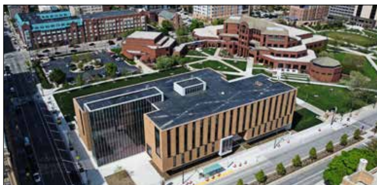
Dr. E. J. and Margaret O'Brien Hall, the new home of Marquette University's College of Business Administration and Graduate School of Management.

designed for remote and in-person learning capabilities, will be a boon for Marquette business' nationally ranked programs. Four undergraduate specialty programs—accounting, supply chain, real estate, and finance—are ranked in the Top 40 nationally by U.S. News & World Report . The Graduate School of Management's executive MBA program is ranked 27th overall and the part-time MBA program is ranked 53rd.