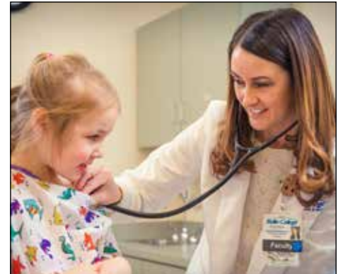
Patient care is at the heart of Bellin College's healthcare education.