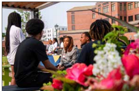
Class of 2023 students in the MKE CRE Summer High School Immersion Program network with Marquette alumni.

"At NAIOP, the diversification of real estate is incredibly important to us.