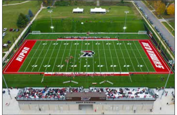
An aerial view of Ripon College's new, on-campus and mixed-use Hopp Stadium.

The new 157,000 square foot facility is designed to support Ripon's continued athletic excellence and enhance the overall student experience. This mixed-use space on the corner of Thorne and Union Streets houses the football and men's and women's soccer teams. Seating 2,000, the new stadium allows for a better fan experience for students