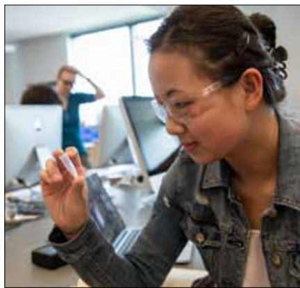
A Beloit student gains hands-on experience in the lab.

The School of Health Sciences will prepare students for healthcare careers