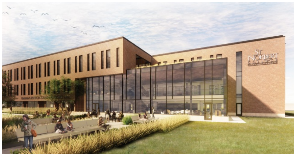
ST. NORBERT COLLEGE, New Business School Project November 16, 2023

The Ripon Commitment provides free or significantly reduced tuition and fees, moving the higher education conversation toward a brighter future.